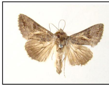
Ctenoplusia placida (Moore)