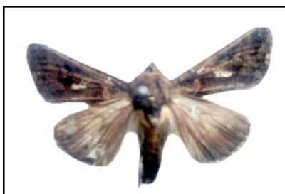
Ctenoplusia limbirena (Guenee)