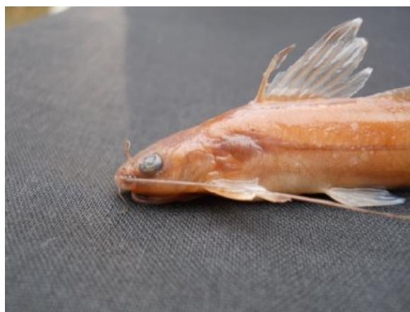
Figure 4. Head- lateral view.

Distribution: Currently known only from the type locality in Kerala.