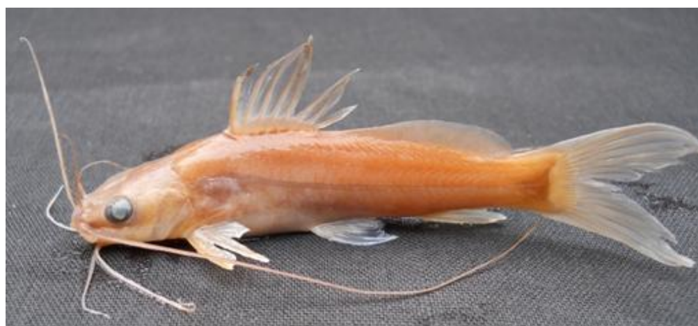
Figure 2. Mystus keralai , Paratype, ZSI FF 5092, Paratype, 58.0 mm SL, Manimala River.