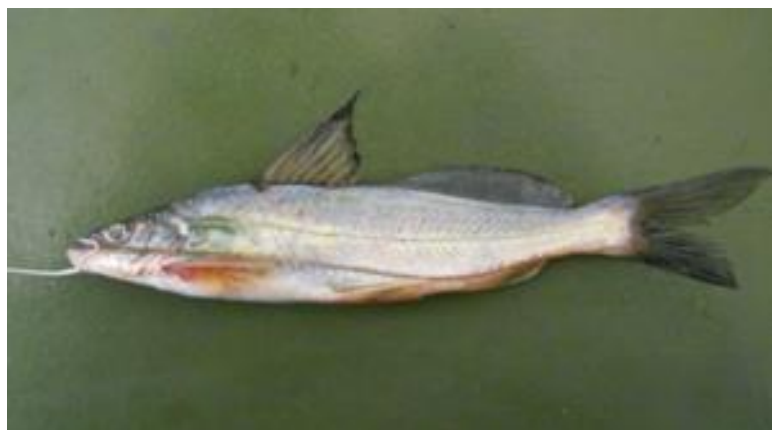
Figure 5. Freshly collected Mystus seengtee , ZSI FF 4936, Mananthavady River, Wayanad, Kerala.

morphometric analysis revealed that the new species differs greatly from these congeners. In Mystus cavasius median longitudinal groove on head shallow, indistinct and white to grayish white (vs. moderately deep, distinct and without a specific colour in the new species), a small black spot present at the base of rayed dorsal fin and on humeral region (vs. no distinct spot at the base of dorsal fin and humeral spot elongated), no spot at caudal base (vs. a triangular brownish black spot present), dorsal spine stronger (vs. weak), anterior part of frontal groove in between eyes shallow (vs. deep), upper caudal lobe markedly longer than lower one (vs. no sharp difference between the two), head shorter (21.4-23.8 % SL vs. 27.1- 27.6) and deeper (64.0- 66.7 % HL vs. 53.1- 62.5), eyes larger (29.2- 30.0 % HL vs. 21.9- 25), base of adipose dorsal fin longer (40.2- 45.6 % SL vs. 34.5- 37.3), body width at anal fin lesser (6.1- 8.0 % SL vs. 10.3- 11.2) and pectoral spine shorter (12.5- 14.9 % SL vs. 16.9-17.2). Hamilton's Mystus differs from the present species in many other morphometric features as shown in Table 1.