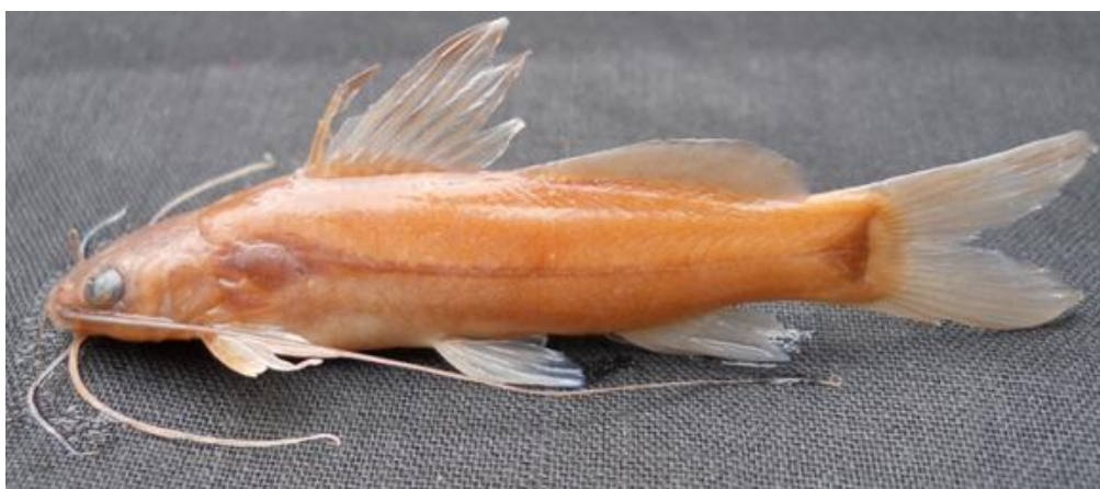
Figure 1. Mystus Keralai , Holotype, ZSI FF 5091, 59.0 mm SL, Manimala River, Kerala, India.

Biometric data are given in Table 1. Head depressed; dorsal profile evenly sloping and ventral profile almost straight. Bony elements of dorsal surface of head covered with thin skin; median longitudinal groove on head narrow, long, reaching base of occipital process; anterior part of cranial fontanelle in between orbits is deep while its posterior part shallow. Occipital process distinct, narrow and reaching basal bone of dorsal fin. Four pairs of barbels; maxillary pair very long, extending beyond base of caudal fin, nasal almost as long as head, outer mandibulars reaching nearly base of pelvic origin and inner pair reach behind pectoral base. Eyes comparatively small; anterior nostrils located nearer to tip of snout than orbit.