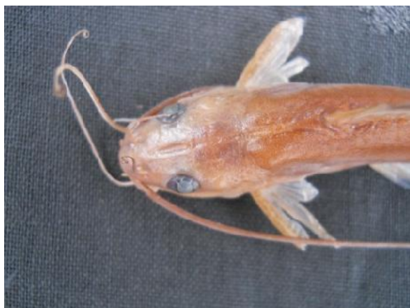
Figure 3. M. keralai head- dorsal view.

Rayed dorsal fin originates considerably behind the origin of the pectoral and fairly in front of pelvic origin; it is higher than the body; its tip not filamentous. Rayed dorsal fin with one spine and seven branched rays; spine ossified but weaker, its outer margin smooth and inner margin feebly serrated. At the base of rayed dorsal fin a '<' shaped small ridge present. Adipose dorsal base fairly long, commencing a little behind rayed dorsal fin and above the origin of pelvic fin. Pectoral fin with one spine and eight branched rays; spine strong, outer margin smooth, inner margin strongly serrated with 12-13 teeth. Pectoral tip never reaches ventral; Ventral fin with one unbranched and five branched rays, located just below the posterior base of rayed dorsal fin, its tip reaches nearly below middle of adipose dorsal and just in front of anal fin origin; Anal fin comparatively longer, provided with four undivided and nine branched rays; it never reaches base of caudal fin.