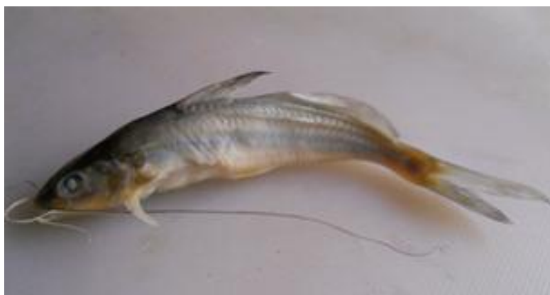
Figure 6. Freshly collected Mystus cavasius , ZSI FF 4930, River Ganges, West Bengal.