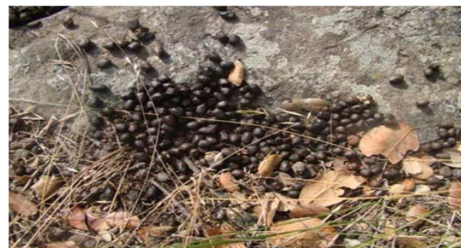
Figure 2: Fecal sample of Goral.